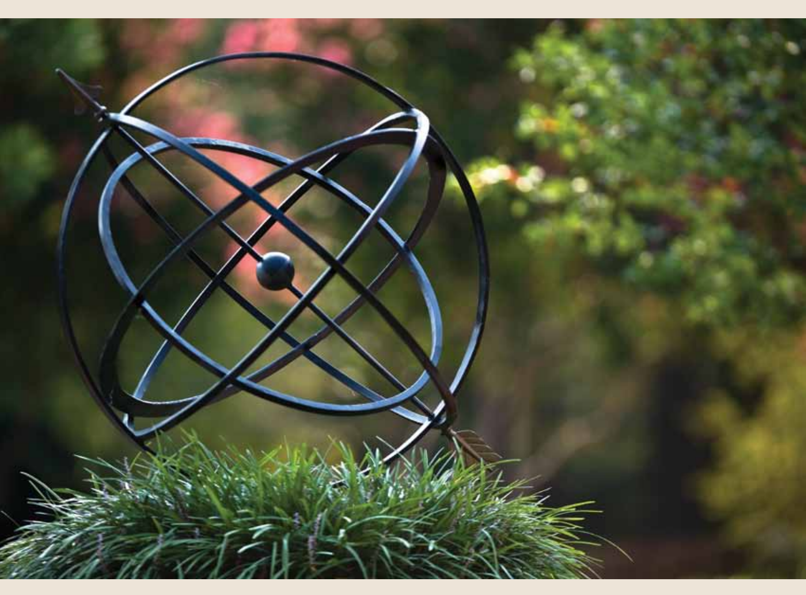
Armillary outside Gottwald Center for the Sciences