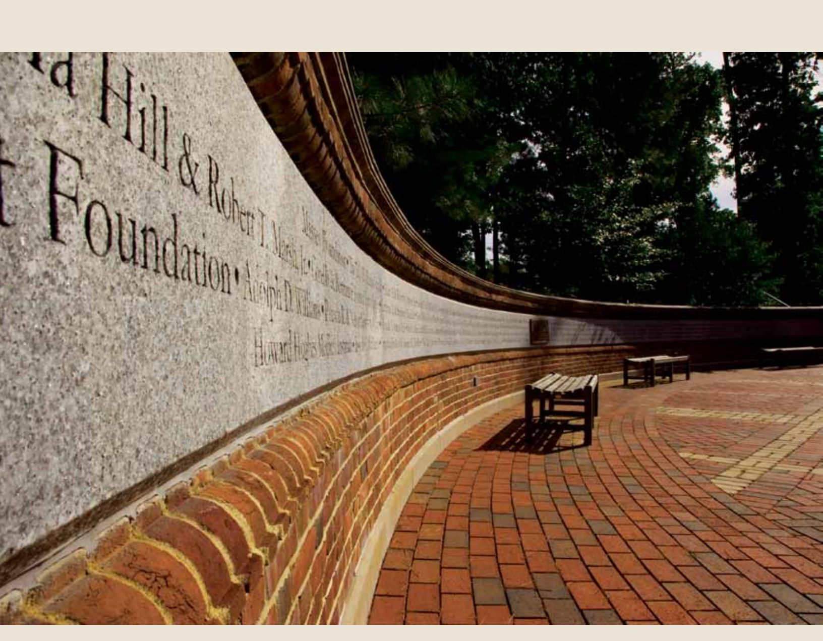
Quatrefoil Society Wall